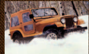
1985 CJ-7 Renegade and 4WD stencil from a CJ-2A tailgate