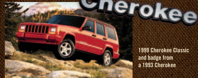
1999 Cherokee Classic and badge from a 1993 Cherokee