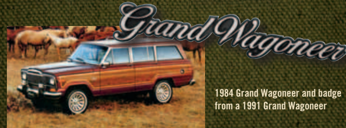
1984 Grand Wagoneer and badge from a 1991 Grand Wagoneer

Jeep Wagoneer The Ultimate in 4-wheel drive