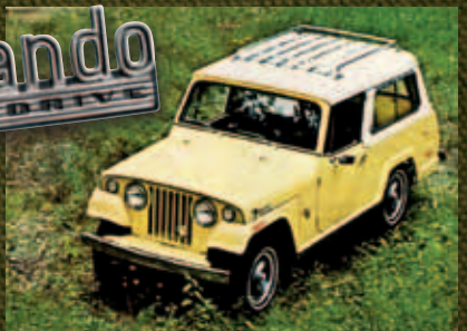
1970 Jeepster Commando and badge from a 1972 Commando