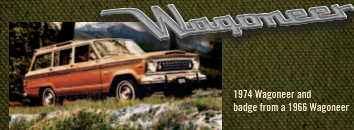
1974 Wagoneer and badge from a 1966 Wagoneer