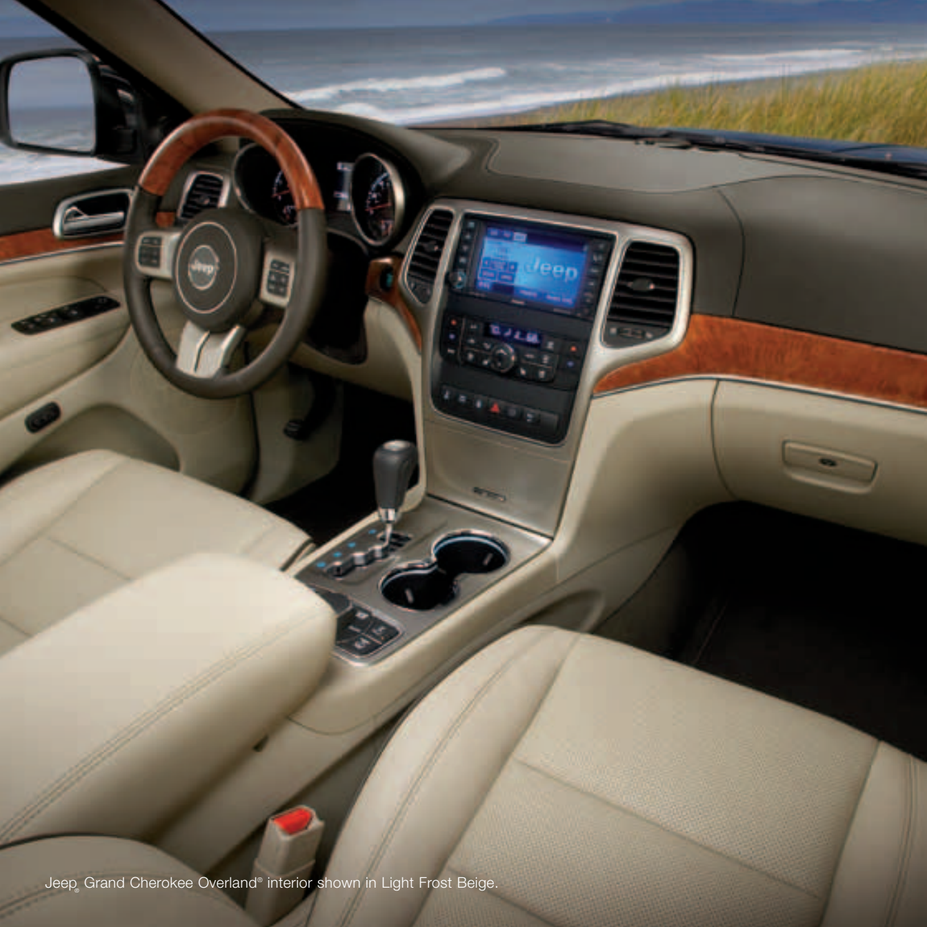
Jeep Grand Cherokee Overland® interior shown in Light Frost Beige.