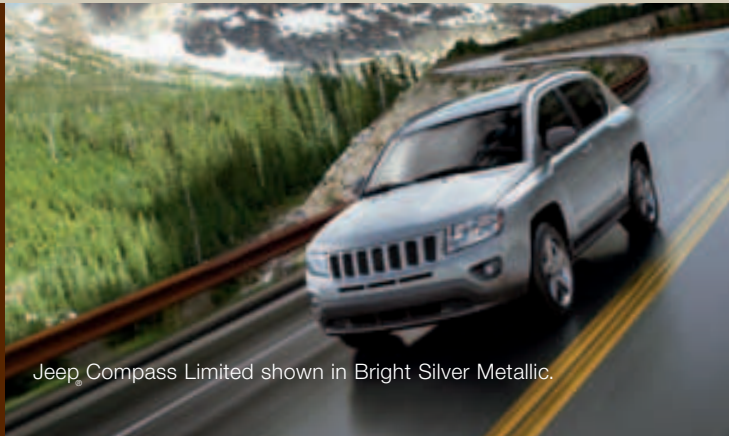
Jeep® Compass Limited shown in Bright Silver Metallic.

THE PERFECT FIT. Reach out to a standard soft-to-the-touch interior that's padded where you'll appreciate it most: the centre console armrest and front-door trim. Chrome accents add a decidedly upscale sparkle to the instrument panel, centre stack, and air vents. The configurable interior lets you arrange things exactly to your liking. The rear liftgate opens to reveal 1719L of cargo room when the standard 60/40 split-folding rear seats and available fold-flat passenger seat are laid down flat.