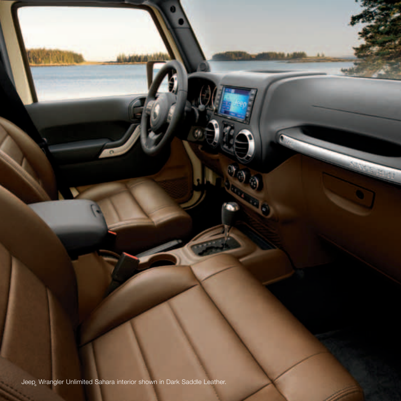
Jeep® Wrangler Unlimited Sahara interior shown in Dark Saddle Leather.