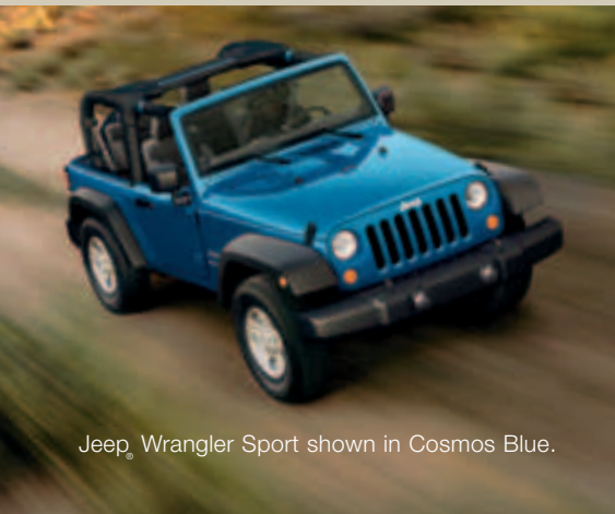
Jeep® Wrangler Sport shown in Cosmos Blue.

Jeep® Wrangler. Here is the Trail Rated® original, fortified with components that give you the freedom to Go Anywhere, Do Anything.™ Whether your quest for adventure takes you over the red rocks of Moab, thrusts you into a rushing river, (2) or sends you out onto roads buried in fresh snow, Wrangler's Trail Rated mantra of unmatched capability holds true wherever your travels take you.