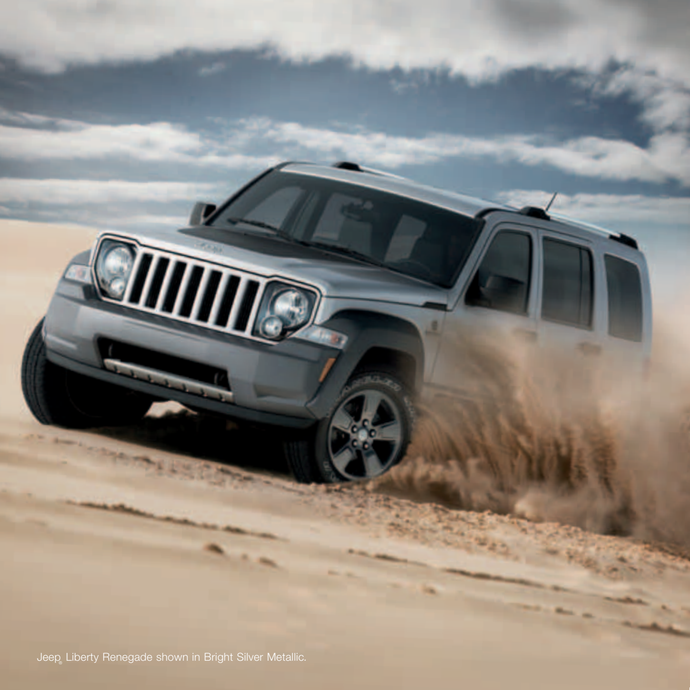
Jeep® Liberty Renegade shown in Bright Silver Metallic.