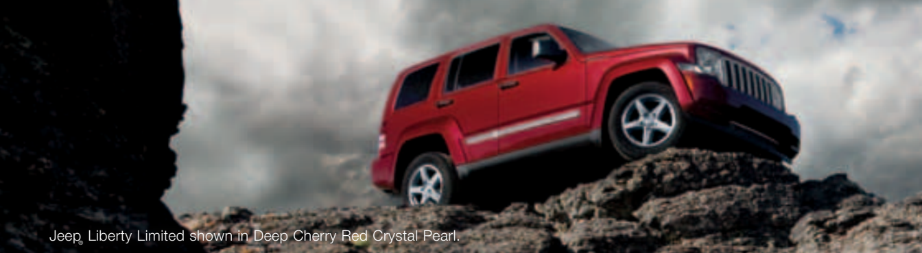
Jeep® Liberty Limited shown in Deep Cherry Red Crystal Pearl.

Jeep® Liberty. The 2011 Jeep Liberty remains true to its legendary 4x4 heritage by delivering authentic capability, a tremendous lineup of standard equipment, plus great value — all packaged within classically rugged Jeep brand design. Choose from two available Trail Rated® four-wheel-drive systems: Command-Trac II™ or the full-time active Selec-Trac™ II. Both deliver agile, confidence-inspiring handling and off-road capability — perfect for the independent adventurer. With a maximum towing capacity of 2268 kg (5000 lb), (3) it's easy to see why Liberty pulls away from all the pretenders.