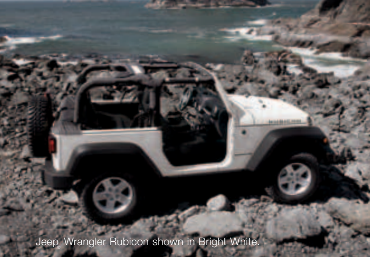
Jeep® Wrangler Rubicon shown in Bright White.