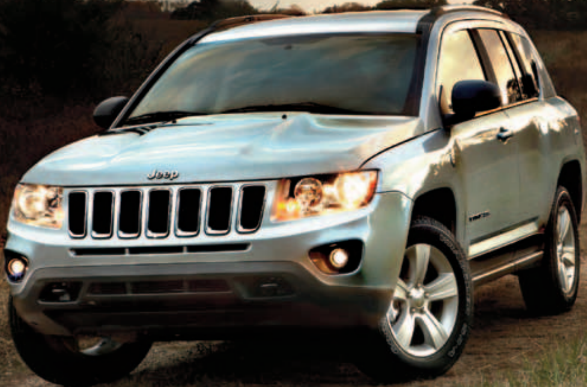
Jeep® Compass Limited with Off-Road Group shown in Bright Silver Metallic.