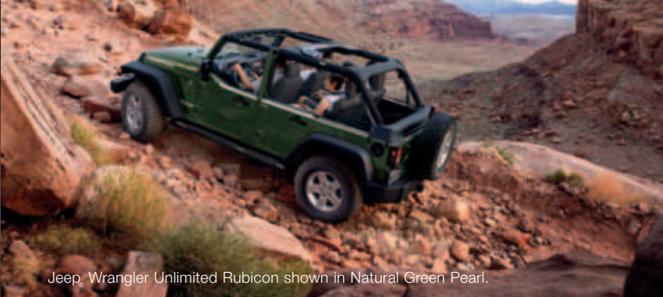
Jeep® Wrangler Unlimited Rubicon shown in Natural Green Pearl.

Jeep® Wrangler Unlimited. With its Jeep Freedom Top® hardtop, Wrangler Unlimited looks made for adventure. Inside, civilized features like an all-new premium interior, chrome details, steering wheel-mounted speed and audio controls, and available leather-trimmed seating create a haven of comfort with no compromise to Sahara's capability. Wrangler Unlimited Rubicon ups the ante, delivering extreme Trail Rated® excitement right out of the box. 2011 Jeep Wrangler Unlimited: All guts, more glory. Let the adventures begin.