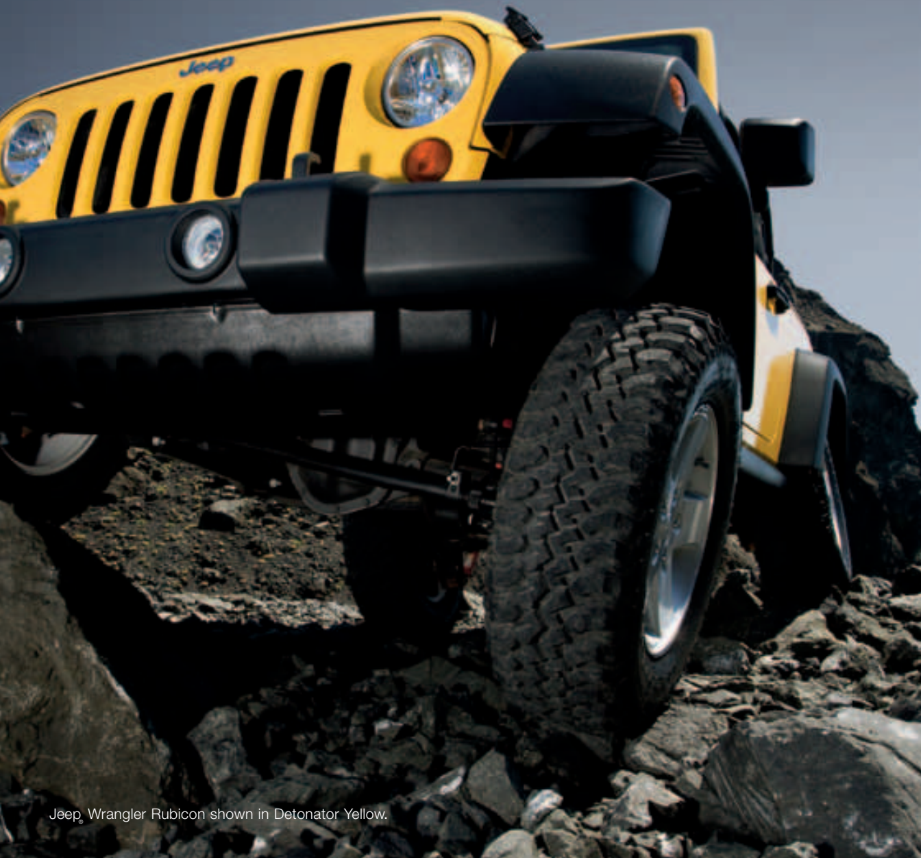
Jeep® Wrangler Rubicon shown in Detonator Yellow.