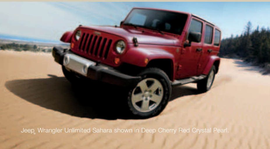
Jeep® Wrangler Unlimited Sahara shown in Deep Cherry Red Crystal Pearl.

Jeep® Wrangler Unlimited. With its Jeep Freedom Top® hardtop, Wrangler Unlimited looks made for adventure. Inside, civilized features like an all-new premium interior, chrome details, steering wheel-mounted speed and audio controls, and available leather-trimmed seating create a haven of comfort with no compromise to Sahara's capability. Wrangler Unlimited Rubicon ups the ante, delivering extreme Trail Rated® excitement right out of the box. 2011 Jeep Wrangler Unlimited: All guts, more glory. Let the adventures begin.