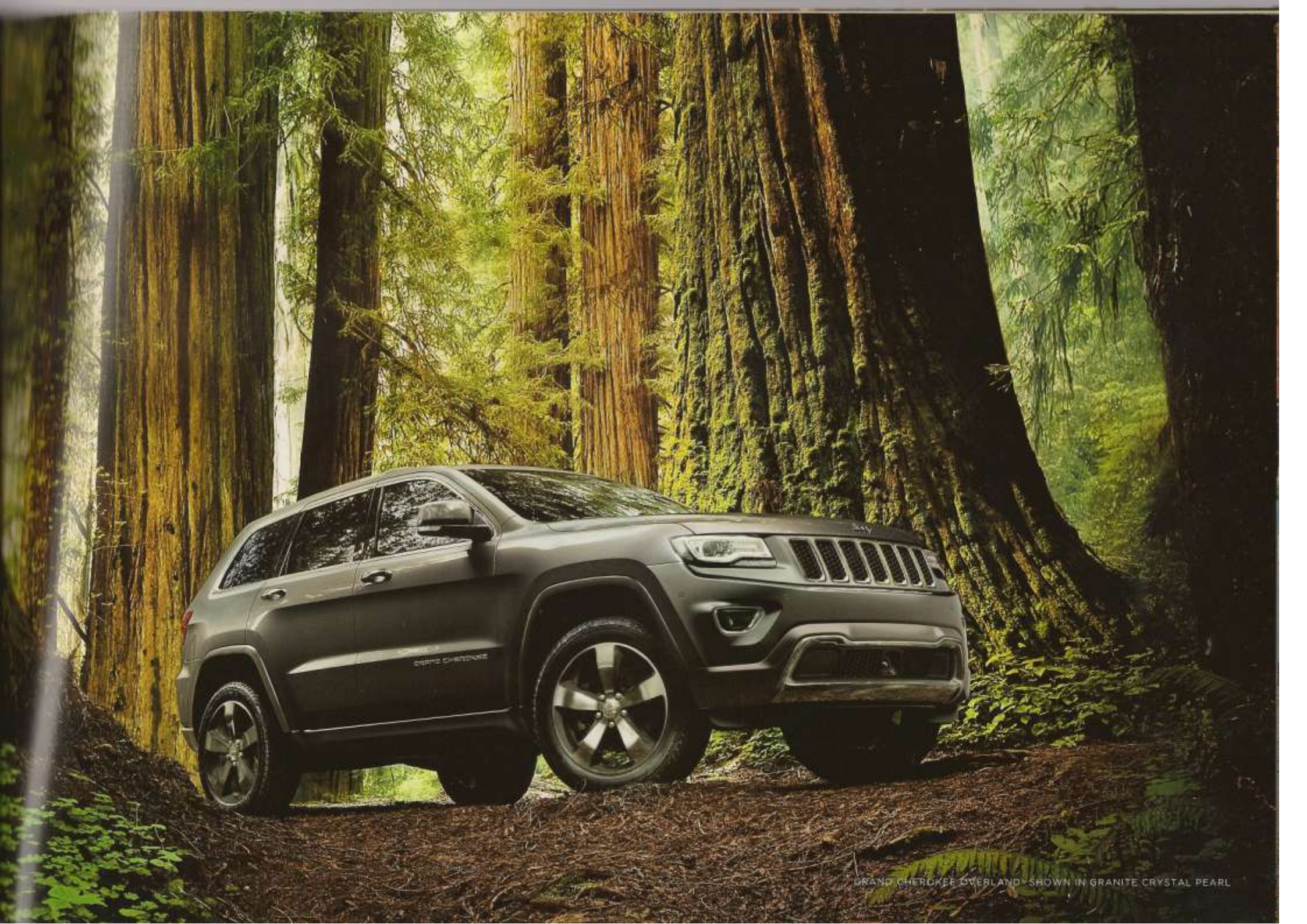
GRAND CHEROKEE OVERLAND ® SHOWN IN GRANITE CRYSTAL PEARL