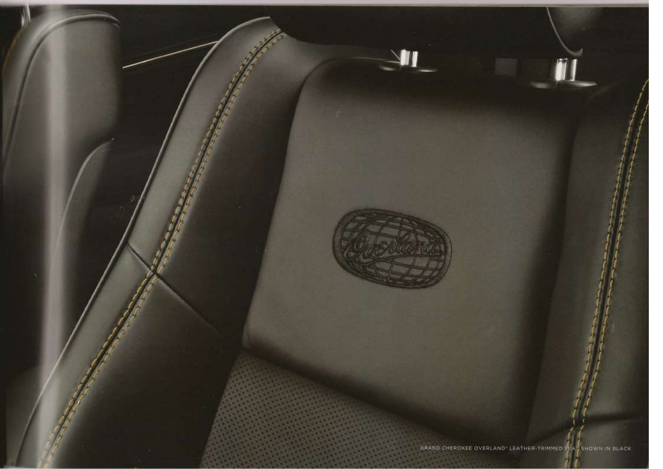
GRAND CHEROKEE OVERLAND® LEATHER-TRIMMED SEAT SHOWN IN BLACK