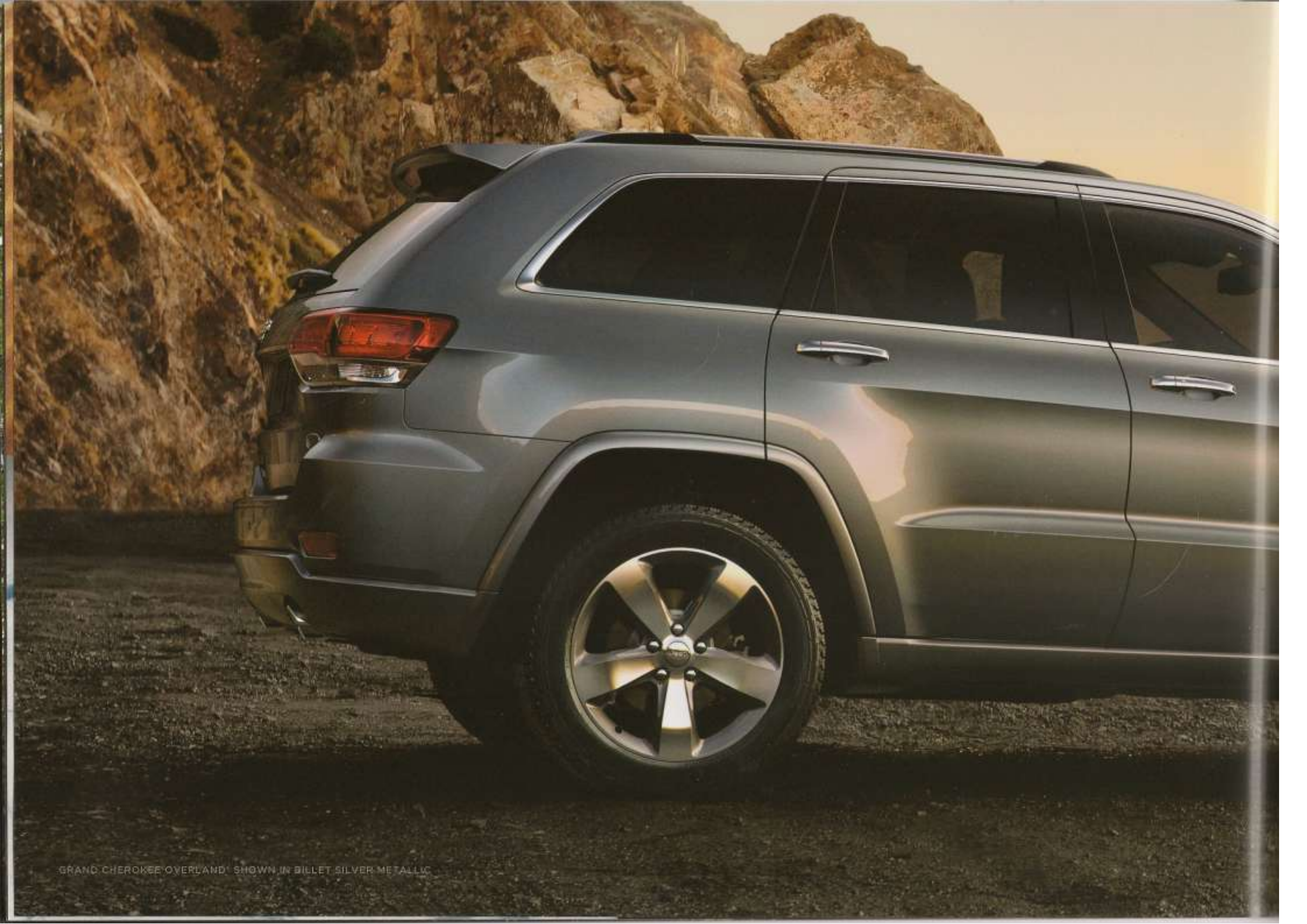
GRAND CHEROKEE OVERLAND ® SHOWN IN BILLET SILVER METALLIC