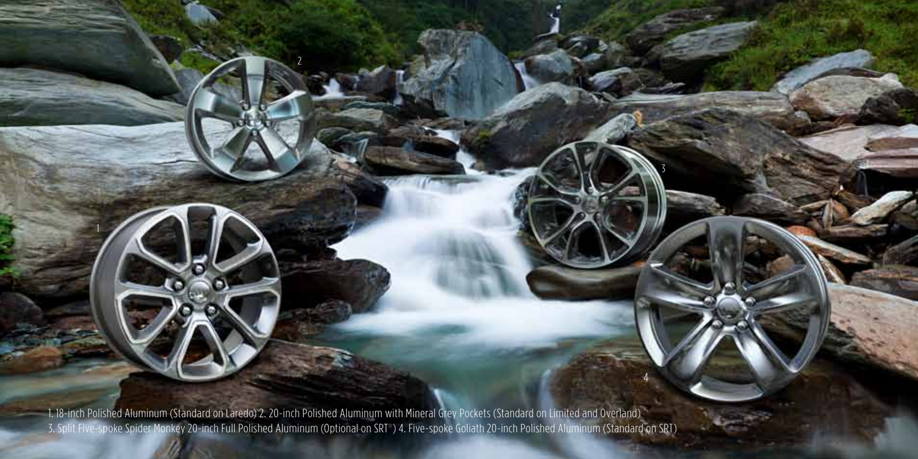
1. 18-inch Polished Aluminum (Standard on Laredo) 2. 20-inch Polished Aluminum with Mineral Grey Pockets (Standard on Limited and Overland) 3. Split Five-spoke Spider Monkey 20-inch Full Polished Aluminum (Optional on SRT®) 4. Five-spoke Goliath 20-inch Polished Aluminum (Standard on SRT)