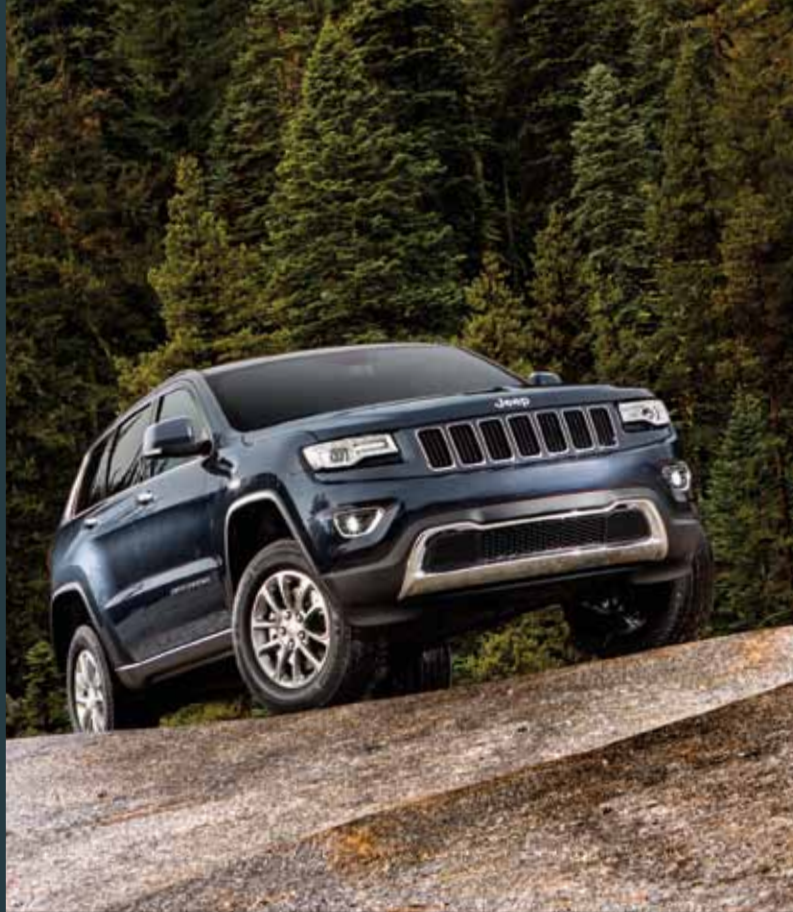
Limited shown with optional Off-Road Adventure Group II fitted