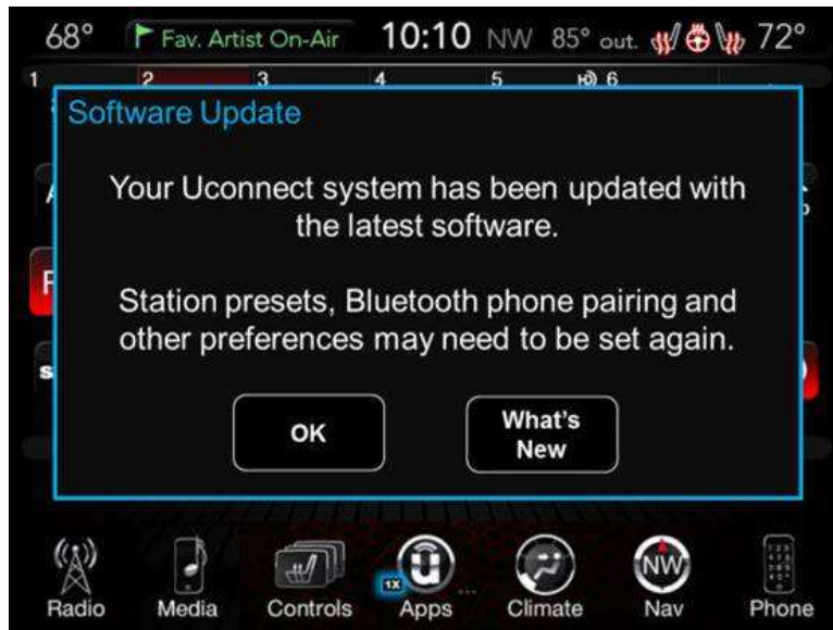
Fig. 4 Confirmation Screen