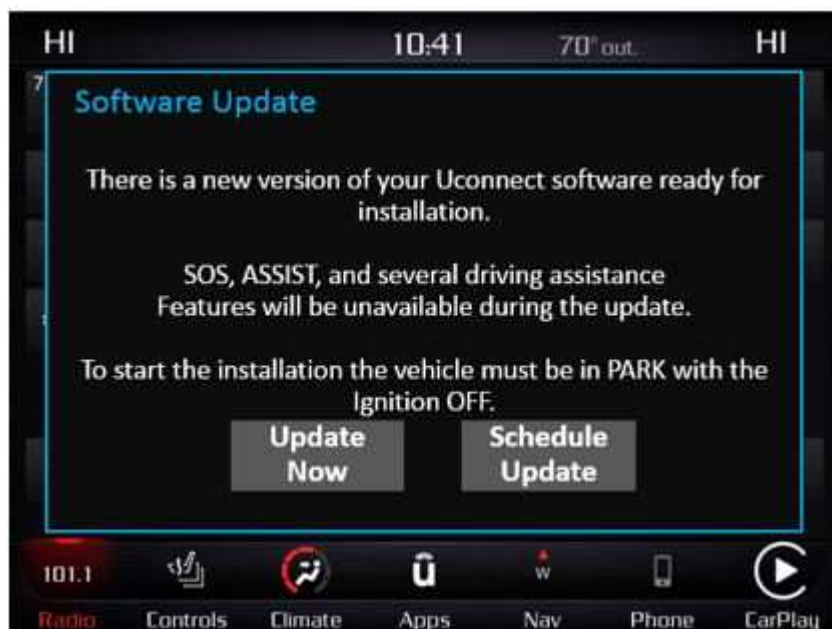
Fig. 1 Software Acceptance Screen

NOTE: This is an “Information Only” Service Bulletin to inform the dealer how the FOTA update is performed. This document does not contain a LOP for reimbursement.