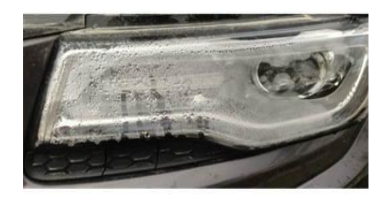
Fig. 2 Heavy Water Droplets Replace Headlamp