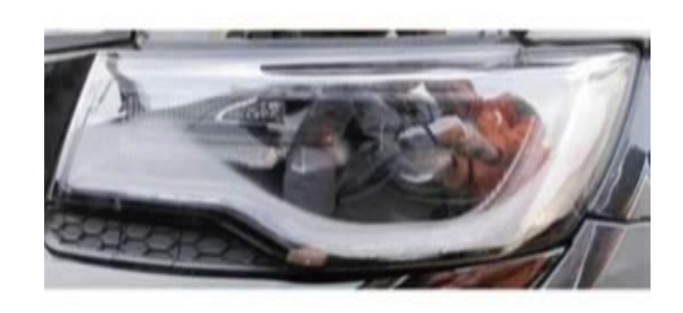
Fig. 1 Headlamp Clearing Install Updated Vents

NOTE: If the condensation/fogging has begun to clear from the lamp lens after 20 minutes of lamps operation, this indicates the lamp sealing has not been breached, and the lamp does not require replacement. See (Fig. 1) and (Fig. 2) for examples of a good and faulty headlamp.