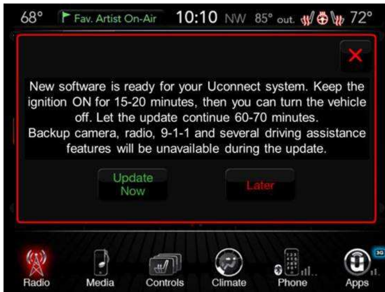
Fig. 1 Software Acceptance Screen