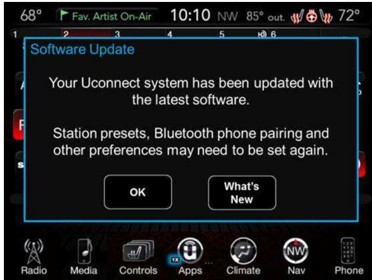
Fig. 5 Confirmation Screen

5. Upon completion of update, the radio will display a confirmation message (Fig. 5) .