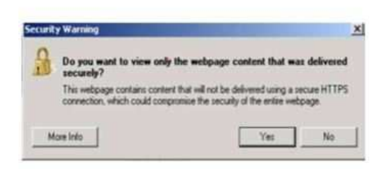
Fig. 2 Pop-up Security Message

NOTE: A blank USB flash drive must be used to download the software. Only one software update can be used on one USB flash drive.