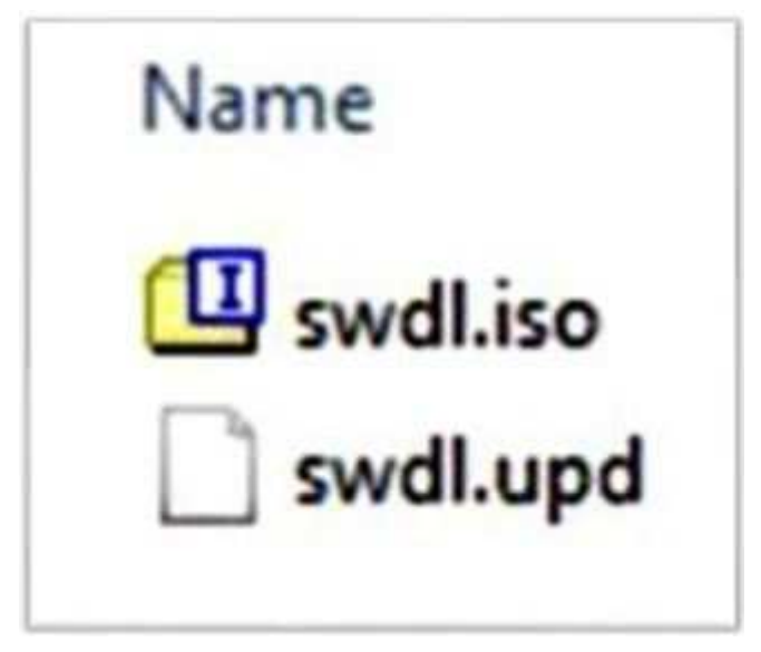
Fig. 1 Two USB Files

NOTE: Two files will be loaded onto the USB flash drive (Fig. 1).