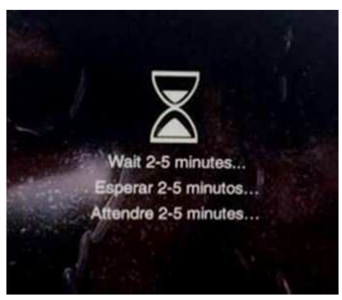
Fig. 3 Hourglass Screen

NOTE: During the update process you will see multiple hourglass and "Please Insert Update USB" screens for extended periods of time (several minutes) (Fig. 3) or (Fig. 4). DO NOT remove the USB flash drive at this time. Only remove the USB flash drive when the update has completed, when the screen displays the software levels again. The screen will say "Software updated successfully".