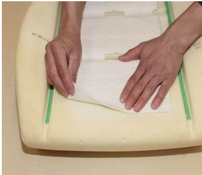
Fig. 1 Remove Heater Element