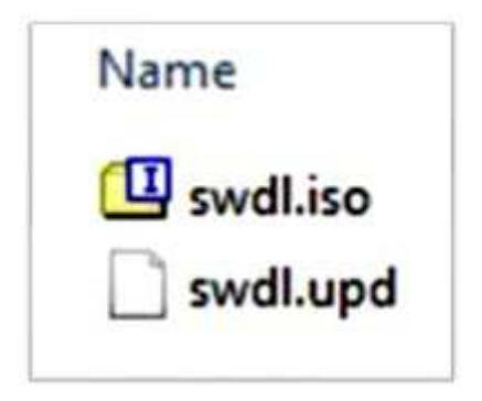
Fig. 1 Two USB Files

NOTE: Two files will be loaded onto the USB flash drive (Fig. 1).