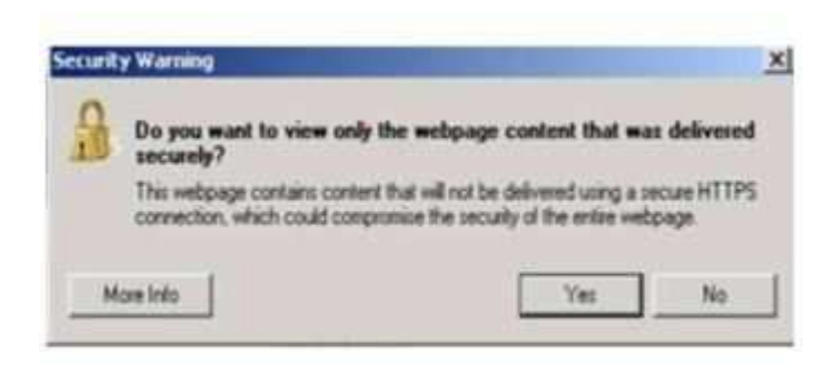
Fig. 2 Pop-up Security Message

NOTE: A blank USB flash drive must be used to download the software. Only one software update can be used on one USB flash drive.