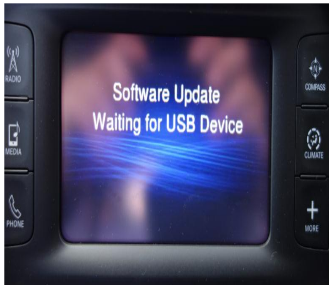
Fig. 6 Radio