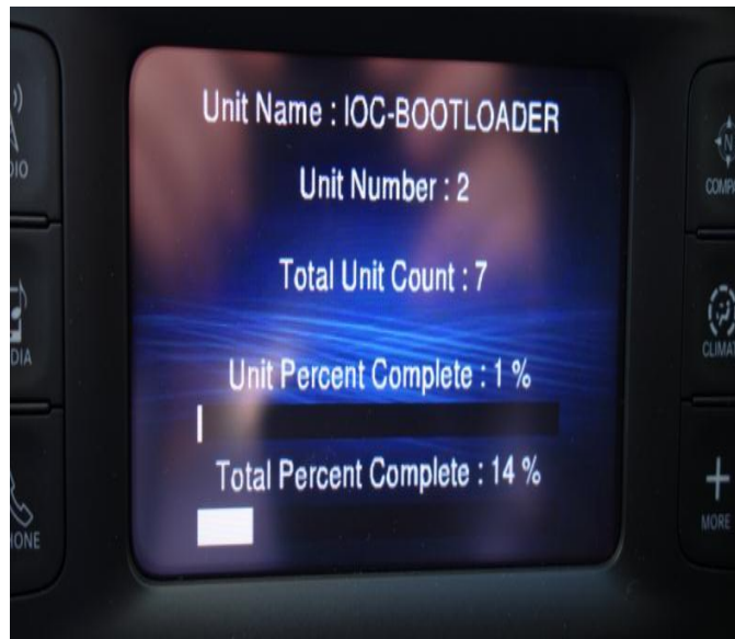
Fig. 5 Radio