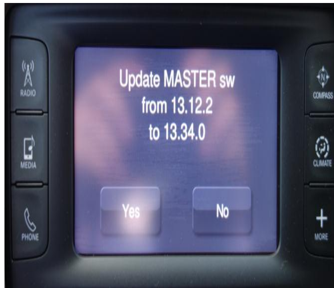
Fig. 1 Radio