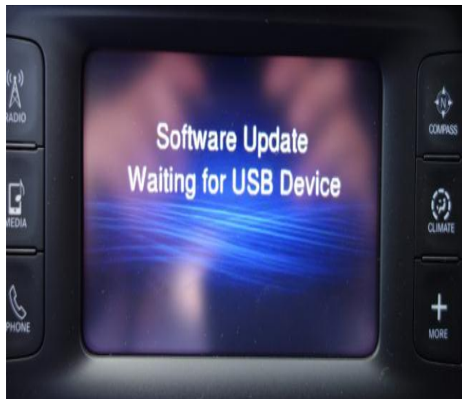
Fig. 2 Radio