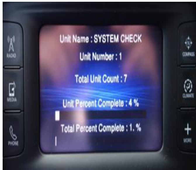
Fig. 3 Radio