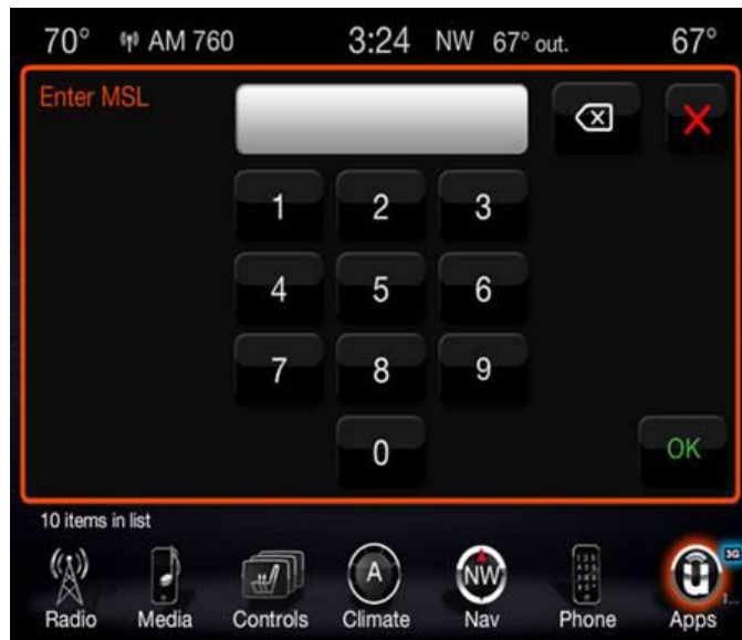
Fig. 6 Enter MSL Code