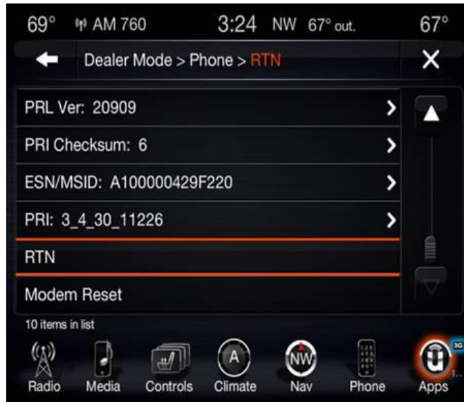
Fig. 5 RTN number