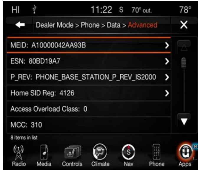
Fig. 2 MEID Number