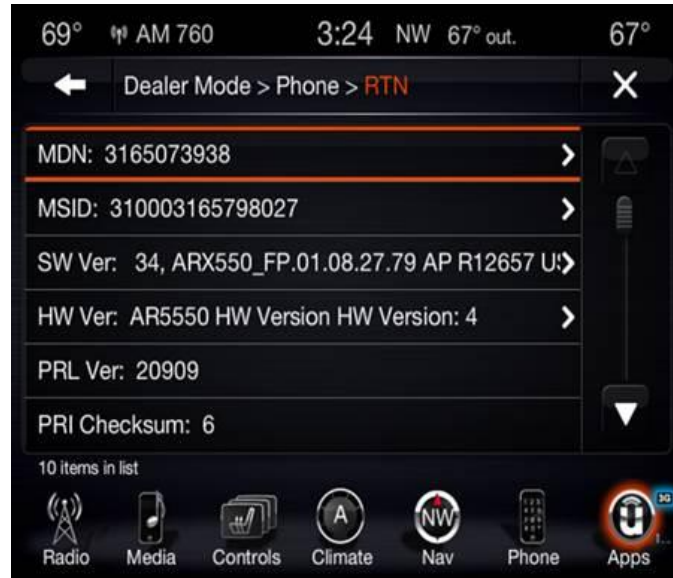
Fig. 4 MDN Number

NOTE: At times when going into the ##RTN# screen the MDN number might remain listed as “NULL”. If this occurs, back out of the screen, re-enter the ##RTN# screen and it will populate the MDN number.