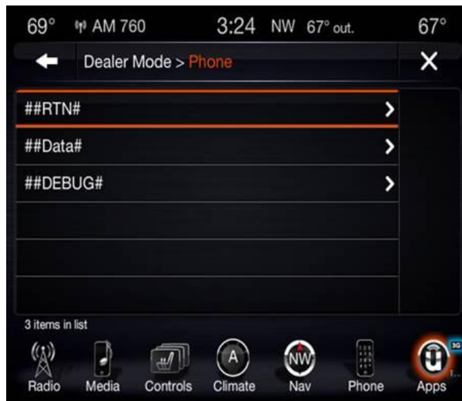
Fig. 3 Back Up Two Screen