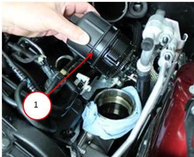
Fig. 2 Oil Filter Removal