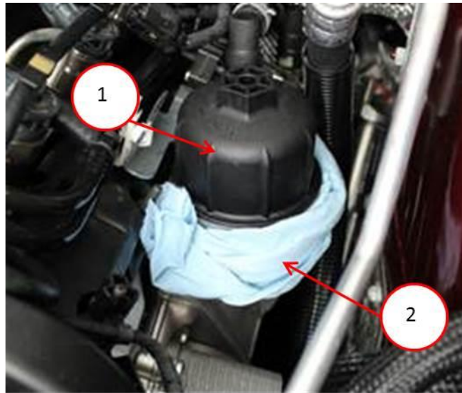
Fig. 1 Oil Filter Housing