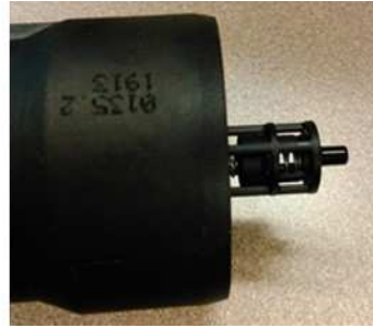
Fig. 2 New Oil Pressure Relief Valve