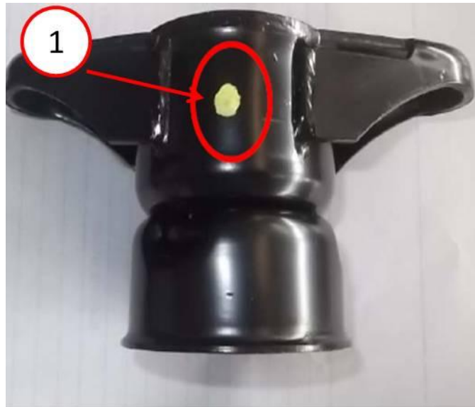
Fig. 1 Yellow Paint Mark

NOTE: Modified part stock will have yellow paint marks (Figure 1) or include a September or later date code (Figure 2).