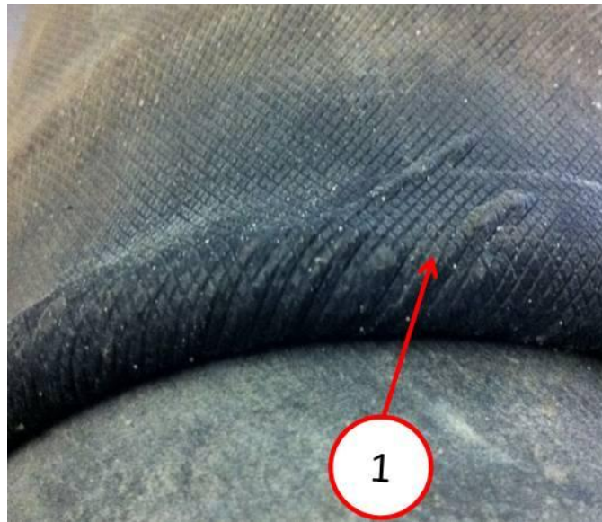
Fig. 4 Rear Air Spring