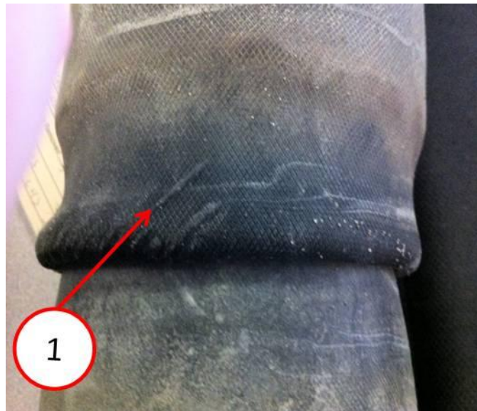
Fig. 3 Rear Air Spring

12. Inspect air spring bellows for signs of damage, such as raised bulges (Fig. 3) and (Fig. 4).