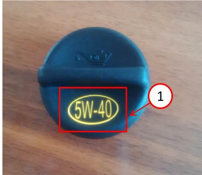
Fig. 3 Cap After Sticker Applied

12. Reinstall the oil fill cap with the new 5W-40 sticker firmly attached (Fig. 3).