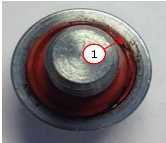
Fig. 2 Damaged Rubber Seal