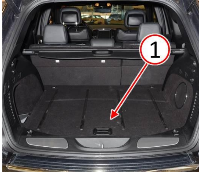
Fig. 7 Install Cargo Compartment Load Floor Panel

11. Install the cargo compartment load floor panel (1) to the vehicle (Fig. 7).