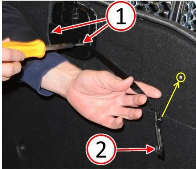
Fig. 6 Install Screws And Tether With Hook