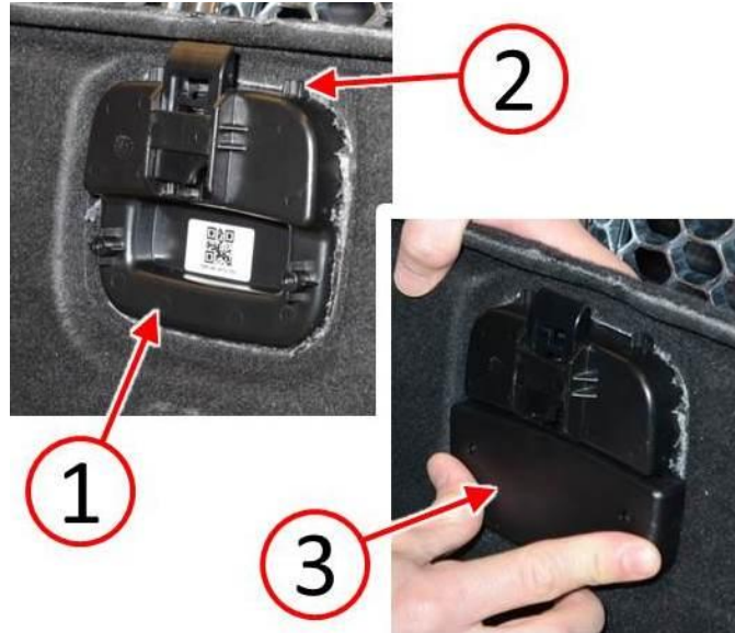
Fig. 5 Install Latch Handle