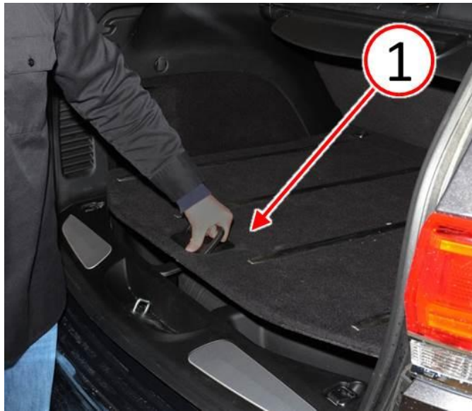
Fig. 1 Remove Cargo Compartment Load Floor Panel