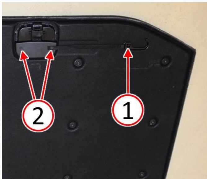
Fig. 2 Remove Screws And Tether With Hook

1 - Latch Handle Screws 2 - Tether Strap With Hook