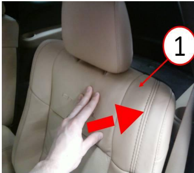
Fig. 1 Inspection