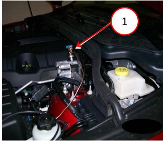
Fig. 1 Installed Test Port